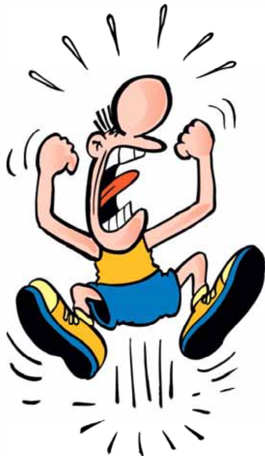
"The eternal loser"

First is the eternal loser , who seems afflicted with the worst luck in the world and can never succeed in anything he undertakes, in spite of his best efforts. For the audience, the question isn't to see whether he will win or lose, but to guess how his next failure will come about.