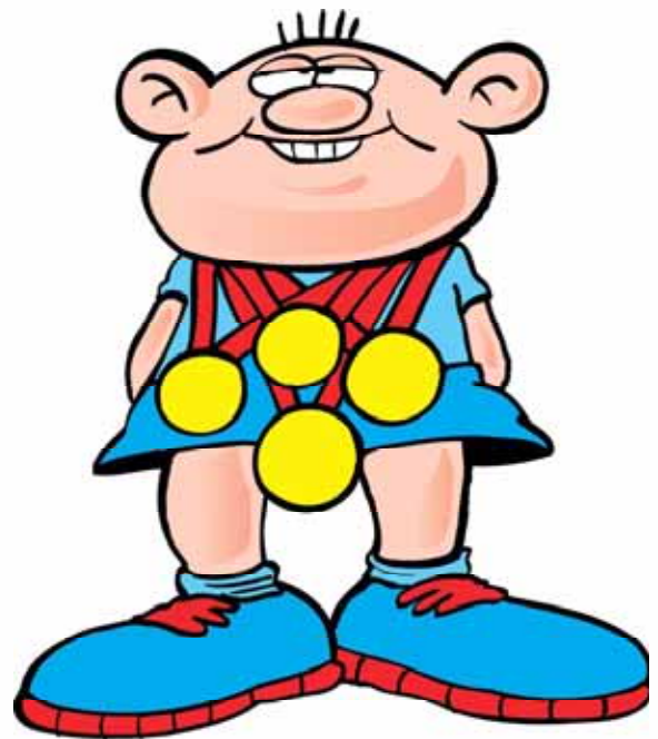
"The eternal winner"

The eternal winner never loses. Gifted for every sport, he almost always wins the gold medal (which he subsequently unwraps and eats, because it's made of chocolate). The principal role of the eternal winner is to present an obstacle to the other characters and to complicate things for them. The eternal winner may sometimes be the object of the other characters' spite (especially the cheater and the eternal loser) and fall prey to their dirty tricks.